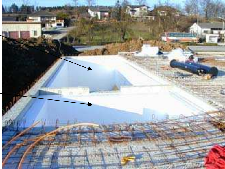
Solarheated car store "Seat Aschauer"

This reservoir is the basic of our future looking solar heating system. It could be built everywhere you want. In every room in your house, or outside.